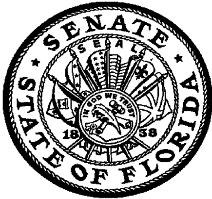
The Florida Senate