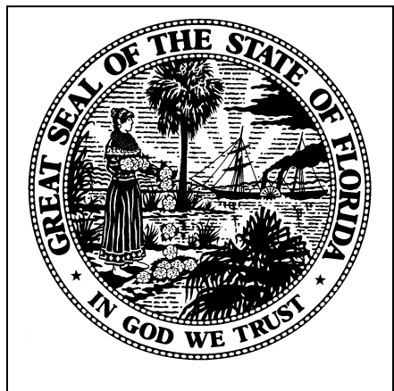
Florida Department of Education