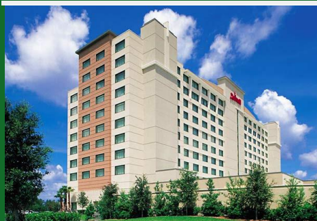
Orlando Marriott Lake Mary