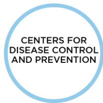
Centers For Disease Control And Prevention