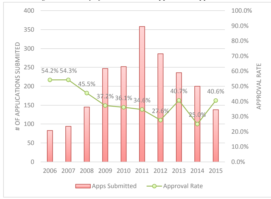
Figure 1. History of charter school application approval rate